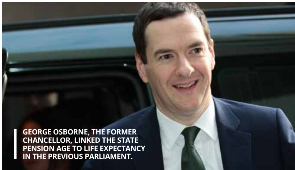
GEORGE OSBORNE, THE FORMER CHANCELLOR, LINKED THE STATE PENSION AGE TO LIFE EXPECTANCY IN THE PREVIOUS PARLIAMENT.

Planning to prevent the financial equivalent of climate change